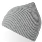
light grey mel