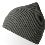
dark grey mel